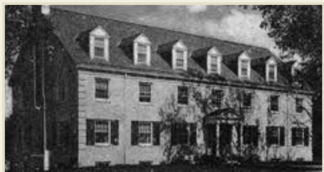
Historic Davis Hall located on the corner of Maple Street and Garland Avenue on the University of Arkansas campus.